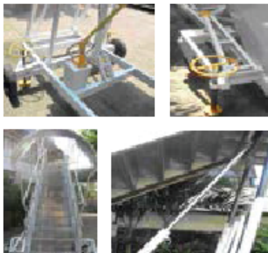
Hydraulic Hand Pump Adjustable